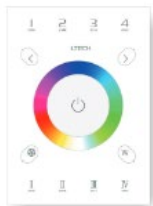
DMX 512 CONTROLLER